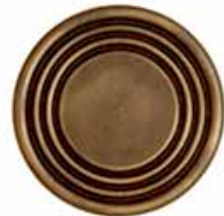
FM Aged Brass