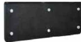
SPACER PLATES (As required)