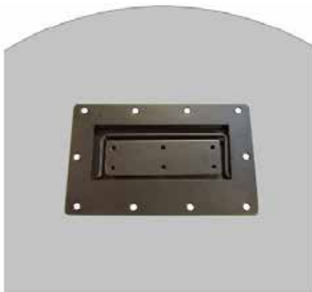
MIRROR BRACKET - Supplied fixed to the mirror back & shown with the wall mounting plate inside the recess

Larger mirrors using our 40mm profile frame may use the following fixing system: