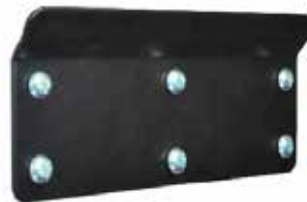
WALL MOUNTING PLATE