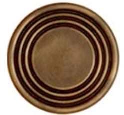
FM Aged Brass