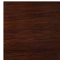
Walnut | Dark | French Polish