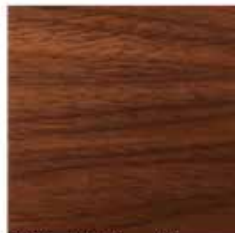
Walnut | Medium | Lacquer