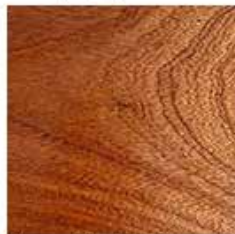
Mahogany | Light | French Polish