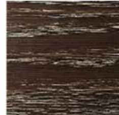
Limed Oak | Dark | Lacquer