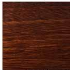
Mahogany | Dark | French Polish