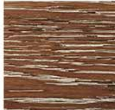
Limed Oak | Medium | Lacquer