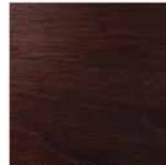
Walnut | Dark | Lacquer