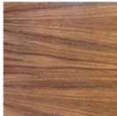
Walnut | Light | Lacquer