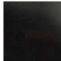
Ebonised | Lacquer

Standard timber finishes shown. Alternative timbers and finishes are available, please enquire for more details.