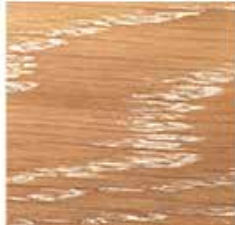
Limed Oak | Light | Lacquer