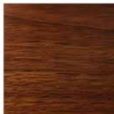
Walnut | Medium | French Polish