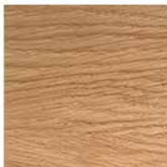
Oak | Light | Lacquer