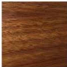
Walnut | Light | French Polish