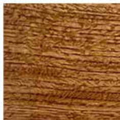
Oak | Medium | Lacquer