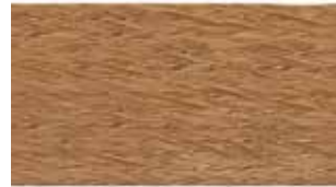
Oak | Medium