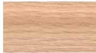
Oak | Light