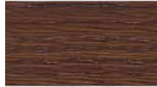
Oak | Dark