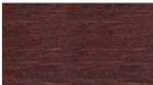
Beech | Mahogany