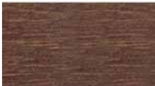
Beech | Walnut