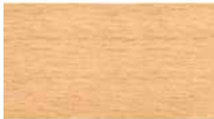
Beech | Natural

The standard Beech legs come in the above range of finishes.