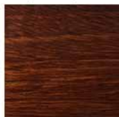
Mahogany | Dark | French Polish