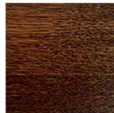
Oak | Dark | Lacquer