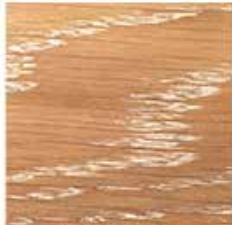
Limed Oak | Light | Lacquer